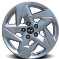
17" alloy wheel Standard on Essential model