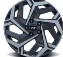
19" alloy wheel Standard on N Line model and N Line model with Ultimate package