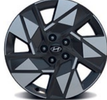
18" alloy wheel Standard on Preferred model